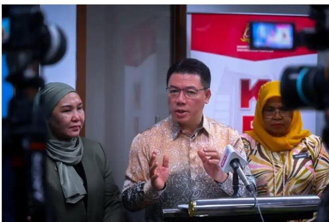
Housing and Local Government Minister Nga Kor Ming speaks at the launch of the UN-Habitat at Urbanice Malaysia, Kuala Lumpur, on December 4, 2024.